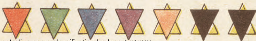
Nazi concentration camp classification badges