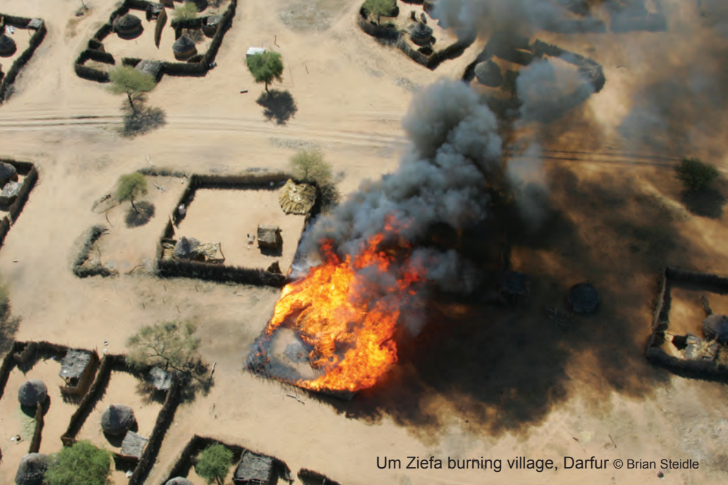
Um Ziefa burning village, Darfur