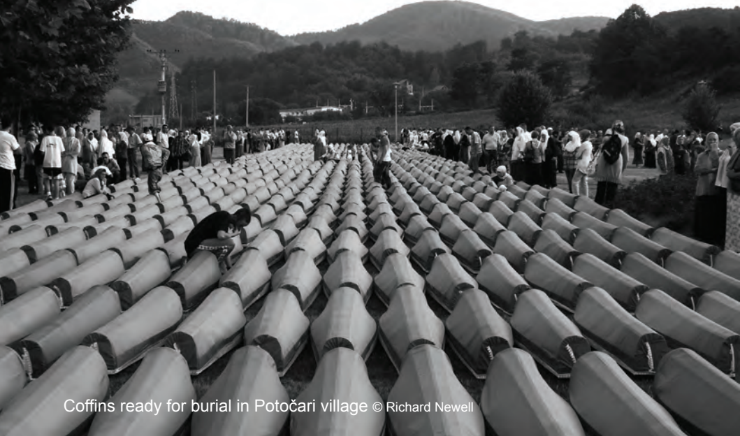
Coffins ready for burial in Potočari village